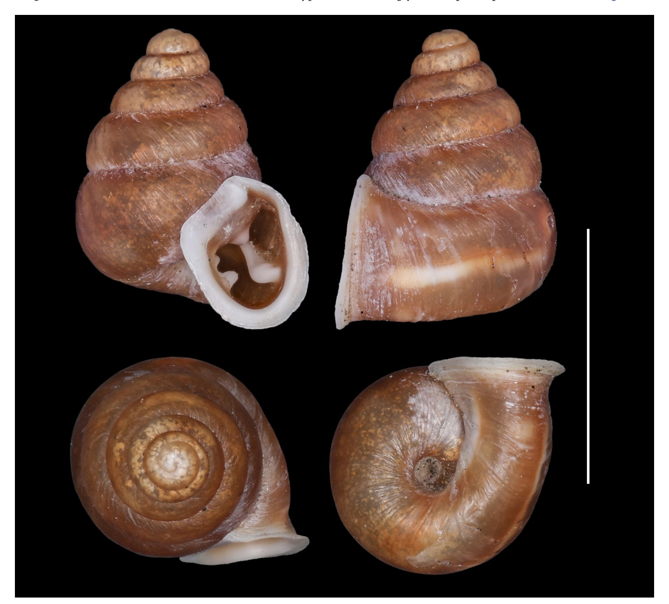
Fig. 1. Pupopsis huangi sp. nov., HBUMM 10027 spec. 1, holotype. Scale bar 5 mm.

Description . Shell small, dextral, light-brownish, oblong-conical, of 5.5–5.75 convex and regularly increasing whorls (Fig. 1); protoconch consists of 1.5–1.75 matt whorls, without characteristic microsculpture; teleoconch gradually widening, with dense growth lines, more pronounced in the region of umbilicus; suture impressed; aperture nearly oval; peristome strongly expanded, partly detached from the body whorl; callus elevated or not; angular tubercle strongly developed; apertural barriers (Figs 2–3)